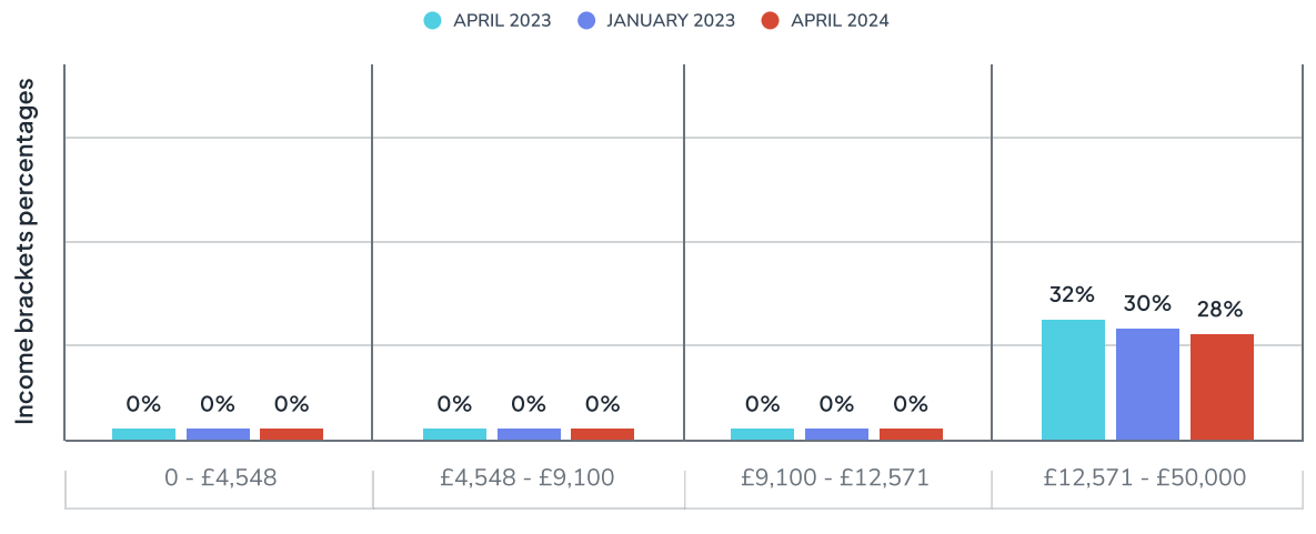
Chart 1: Marginal tax rates for low income lone parent with two children, not receiving UC

We find that lower and middle income earners will see their marginal tax rates go down by 1.8% because of the 4p cut to National Insurance. Chart 1 shows the marginal tax rate for a lone parent household with two children, not receiving Universal Credit.