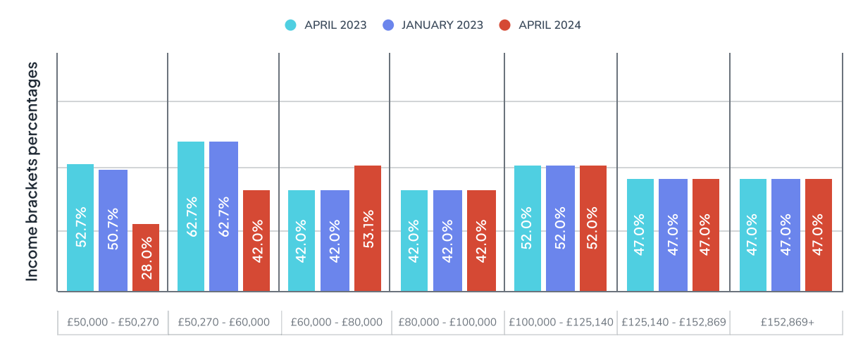
Chart 3: Effective marginal tax rates for low income lone parent with two children, receiving UC

Families with children earning between £60,000 and £80,000 will see an increase in their effective marginal tax rate, but this is because they now receive some Child Benefit, whereas previously Child Benefit was reduced to zero when one parent's earnings hit £60,000 a year.