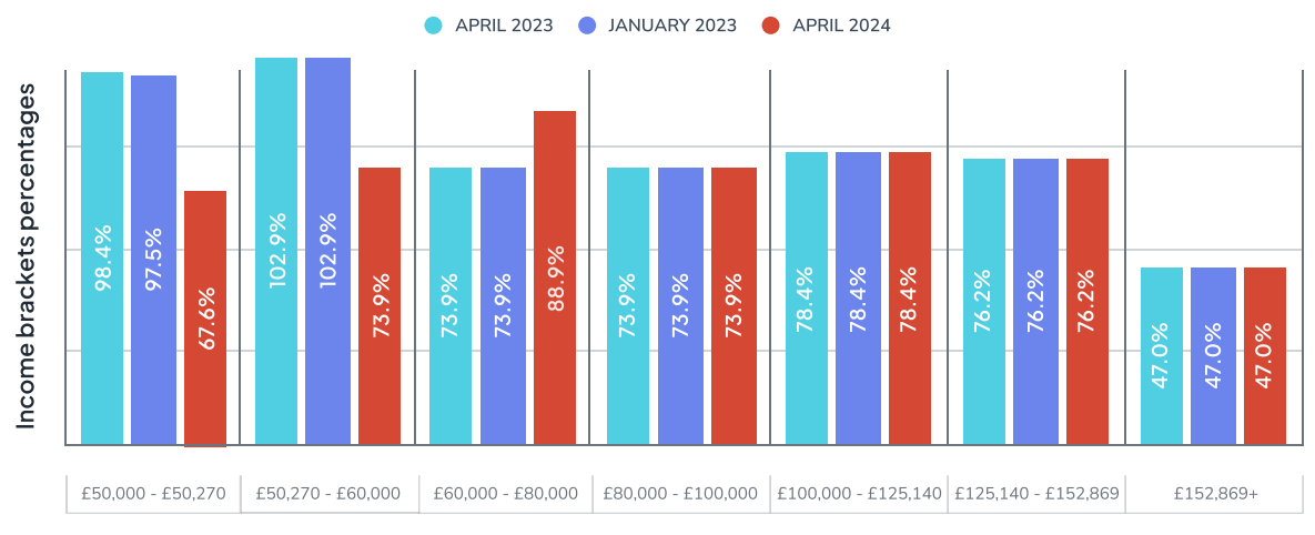
Chart 4: Effective marginal tax rates for a middle income lone parent with three children, receiving Universal Credit

For families on Universal Credit earning above £50,000, the falls in marginal tax rates are almost as steep. In our 2023 report, we found that households with three children faced an effective marginal tax rate of 102.9%. The interaction between the withdrawal of Child Benefit and Universal Credit together, meant they would lose money for earning more, in contrast to the work incentives UC aspires to create. Now, this family would face an effective tax rate of 73.9% due to the HICBC threshold rise. While this substantial fall in their effective marginal tax rate is welcomed, 73.9% is still too high, and it rises to 88.9% once Child Benefit begins to be withdrawn above £60,000. This is one of the main reasons for abolishing the High Income Child Benefit Charge altogether.