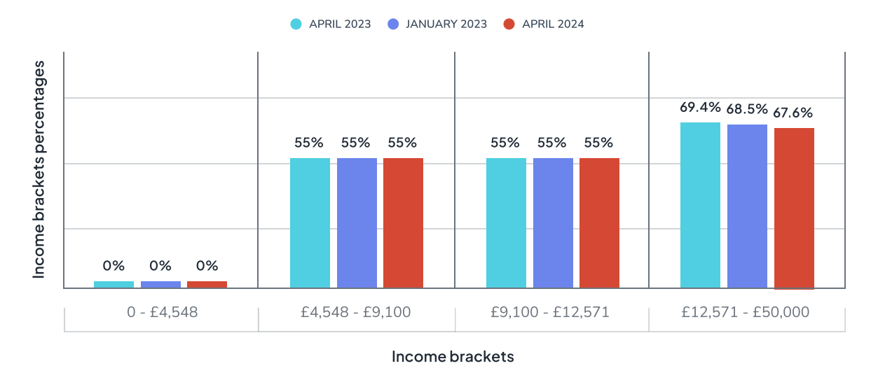
Chart 2: Effective marginal tax rates for low income lone parent with two children, receiving UC

When the lone parent in this example earns above £12,570, she will get to keep an additional 4p for every £1 that she earns. This is a substantial tax cut. This cut also means that a household with a single earner making £35,000 a year will be £897.20 better off. But, if the same parent is receiving Universal Credit, she will see most of her income clawed back.